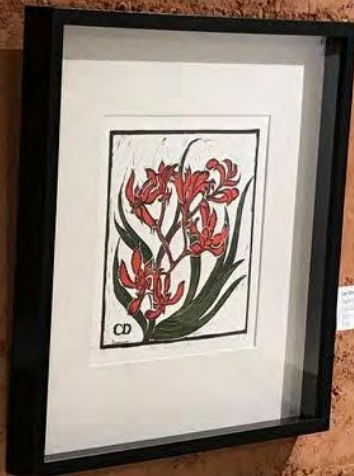
Red Flowers (red background) AP Vincent on monochrome background 2016 $150